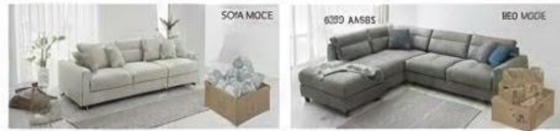
Model Y127-125 (L Shape Sefa)

Datenaat: High Dares c Elm, Sord) Yvepp-4 Conbiury Fabric