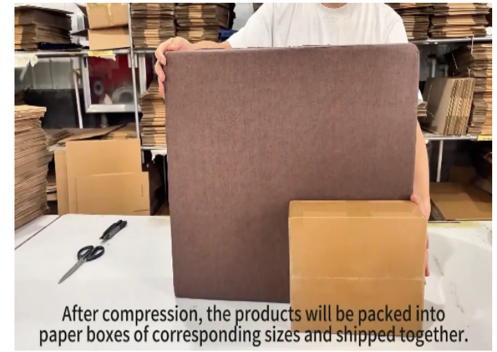
After compression, the products will be packed into paper boxes of corresponding sizes and shipped together.

B2B Value Proposition: • Cost Savings: 4x Increased Lossing Tdret Capacity, Repuccd • Silipping & slo-age Cests • Converlent Delivery, Ideal for E-commerce & Retail Pick up